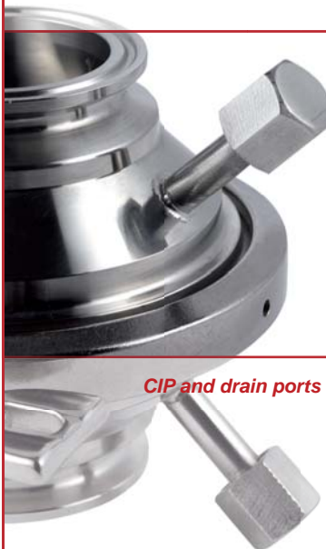
CIP and drain ports