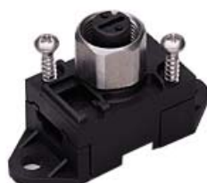
AS-i insulation displacement connector

Up to 62 AS-i connectable C-TOP units per Master